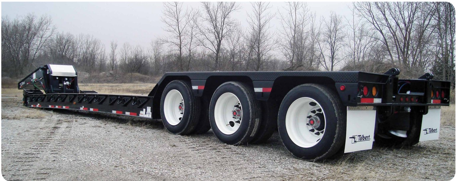
Pictured with optional rear bridge fenders.

Various Options Available Upon Request. Specifications Subject To Change Without Notice.