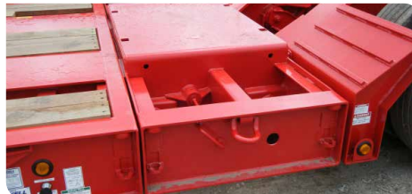
Optional Rolling Bunk - Side View