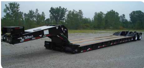
Industry Leading 20 in. Loaded Deck Height

Various Options Available Upon Request. Specifications Subject To Change Without Notice.