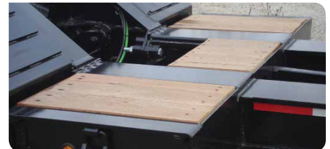
Optional "RA" - Removable Rear Bridge